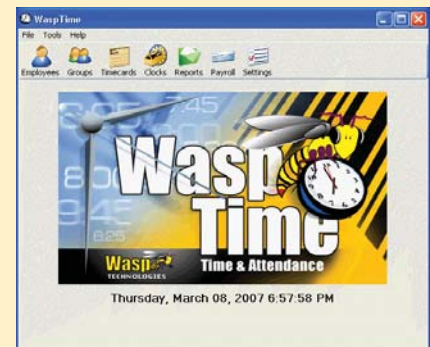
▶ Main Screen

WaspTime solutions provide business owners, HR and payroll administrators an easy way to gain control of employee time.